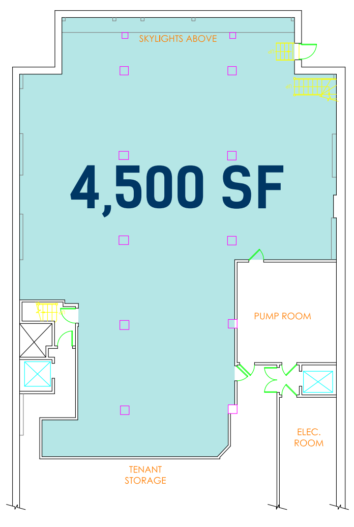
WEST 27th STREET