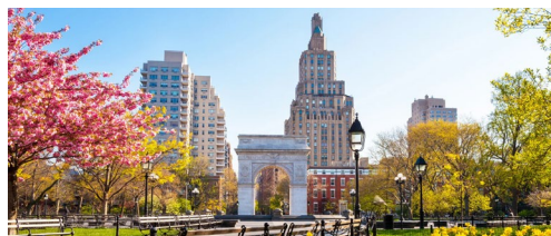
Washington Square Park 12M visitors annually