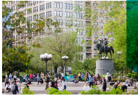
Union Square Park 4 min walk

Thomas Galo 212-792-2602 tgalo@winick.com