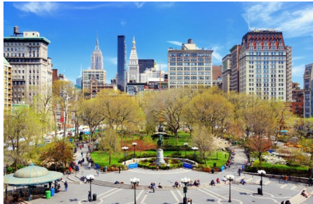
Union Square Park 375K daily visitors