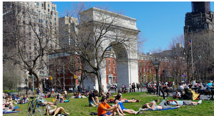
Washington Square Park 5 min walk