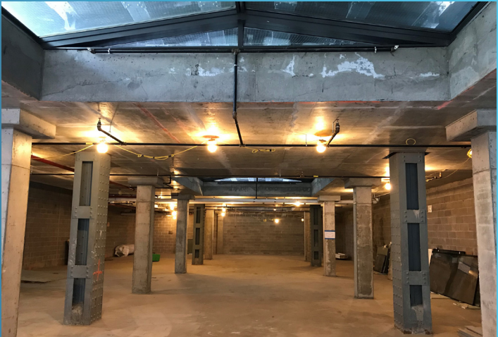
Space C interior