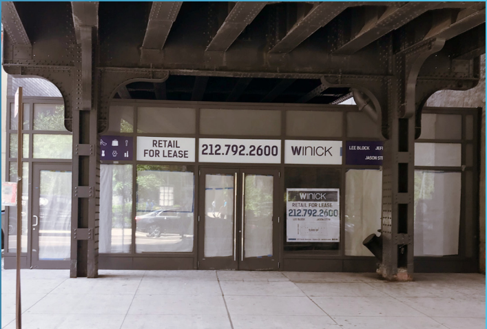
Space C storefront