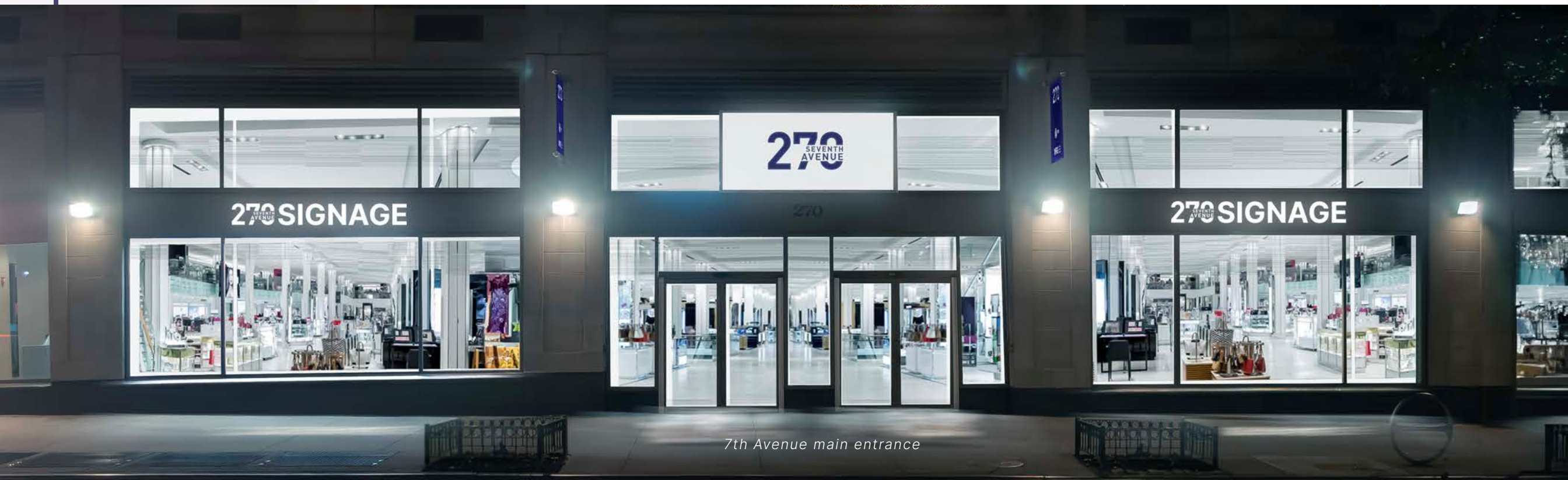
7th Avenue main entrance

Feel free to reach out to our exclusive brokers anytime.