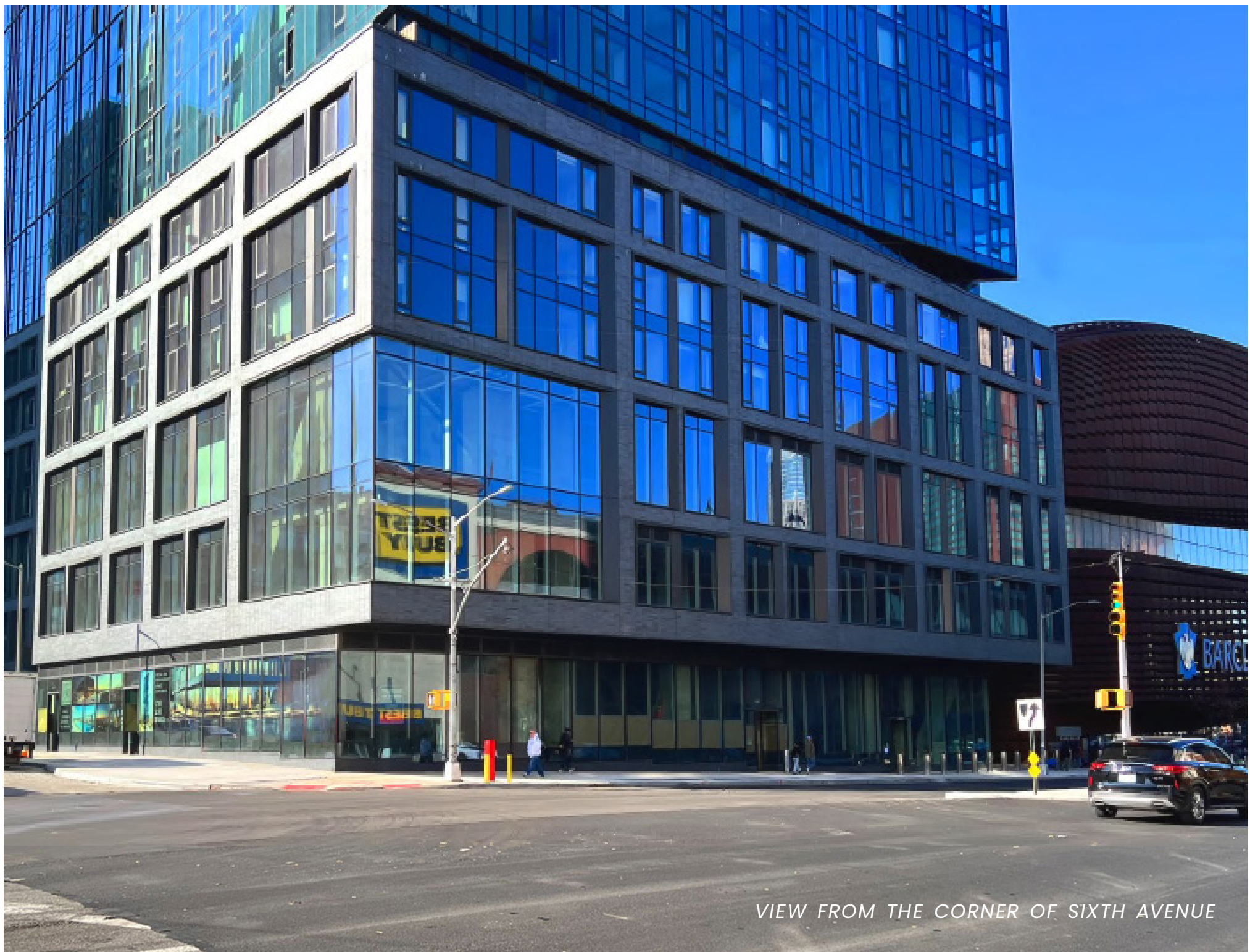
VIEW FROM THE CORNER OF SIXTH AVENUE